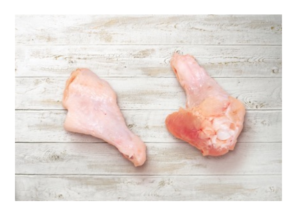
Chicken wing, 1st joint, prime, 10 kg crt Chicken prime wings (drumette) Product code: FI 2144