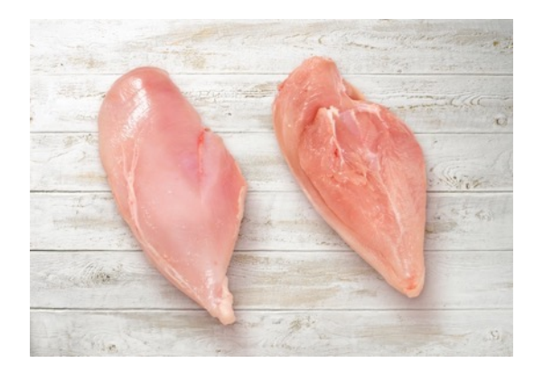
Chicken fillet, weight selected Chicken fillet without inner fillet, 165-195 g Product code: FI 2938, EE 8282