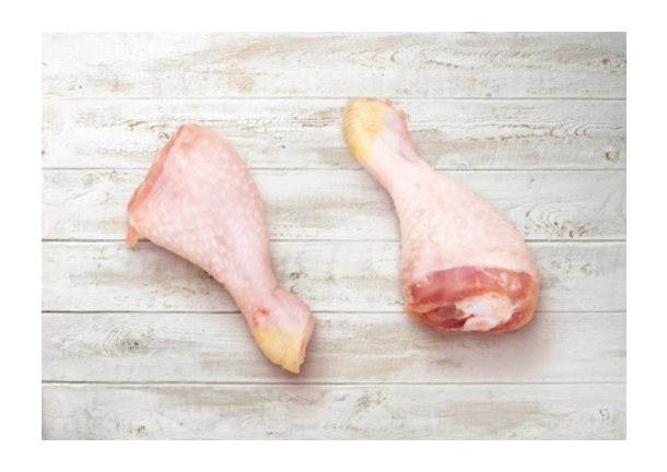
Chicken drumstick, 10 kg crt Chicken drumstick. Product code: FI 2121