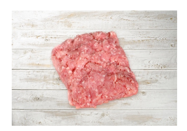
Turkey thigh separated, block frozen