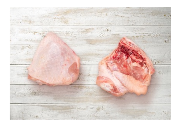
Chicken thigh, 10 kg crt with back bone Chicken thigh, with back bone, without tail. Product code: FI 2102