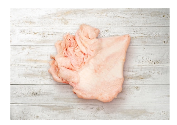
2364 Chicken breast skin, grinded 3 mm