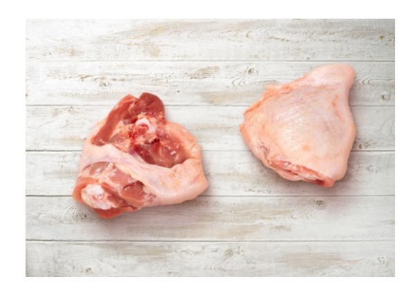
Chicken thigh, 10 kg crt without back bone Chicken thigh without back bone. Product code: FI 2139