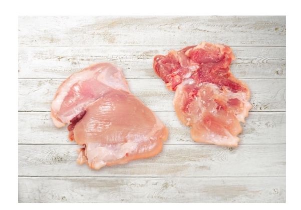
Chicken thigh meat, 10 kg crt Boneless, fat 6,6%, frozen.