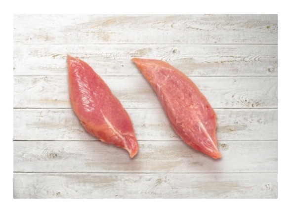
Turkey inner filet Turkey inner fillet. Product code: FI 2039

Turkey fillet without inner fillet, with brine. Meat content 90%, water, salt 0,6%. Product code: FI 2190, FI 2336 FI 2407 with skin on, naturel