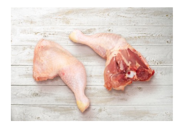
Chicken legs without back Chicken leg, without back bone Product code: FI 2128