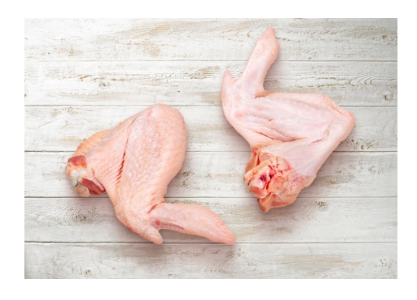
Turkey wings 3-joint, mixed male and female Approx. 15 kg crt Product code: FI 2618