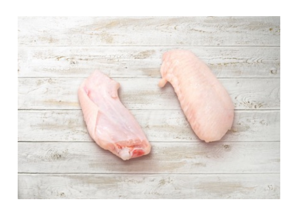
Chicken wing, middle, 10 kg crt Chicken mid-wings. Product code: FI 2140