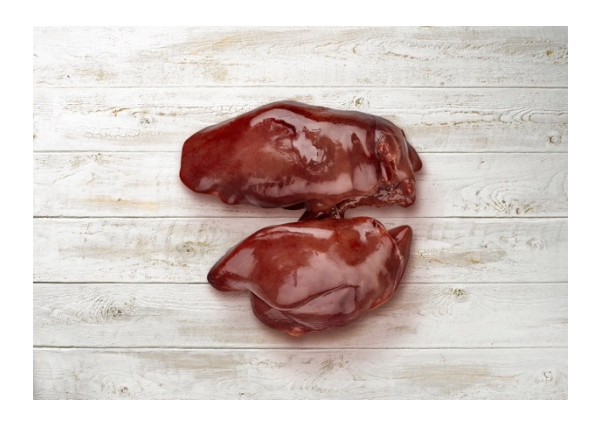
Chicken liver, 10 kg crt Product code: FI 2162