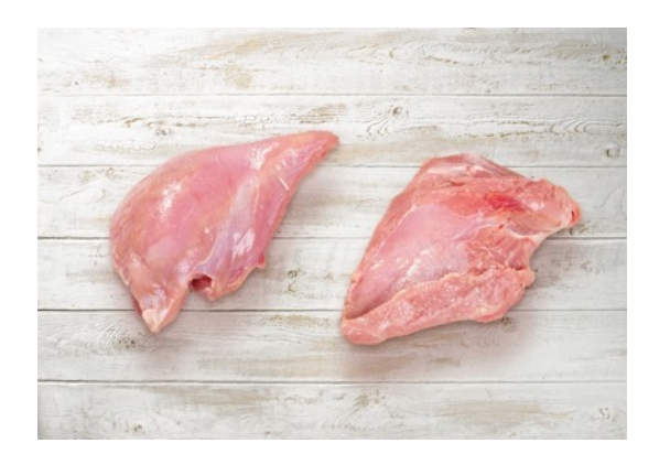
Turkey filet, 900-1000 g, Turkey fillet, skinless, without inner. Product code: FI 2336 FI 2490 over 1,2 kg