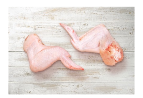
Chicken wings, 70-86g Chicken wings, 3-joint, approx. 70-86g. Product code: FI 2154, EE 12204