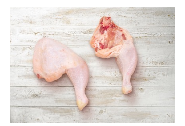
Chicken leg quarter, 10 kg crt Chicken leg quarter without tail, short back. Non-calibrated, approx. 270-350g. Product code: FI 2126