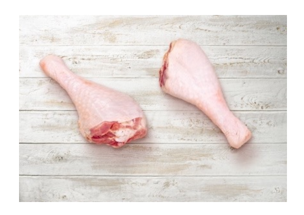
Turkey drumsticks male/female Turkey drumstick. Approx. 15 kg crt Product code: FI 2001 male 900-950 g/pc FI 2010 female 330-400 g/pc