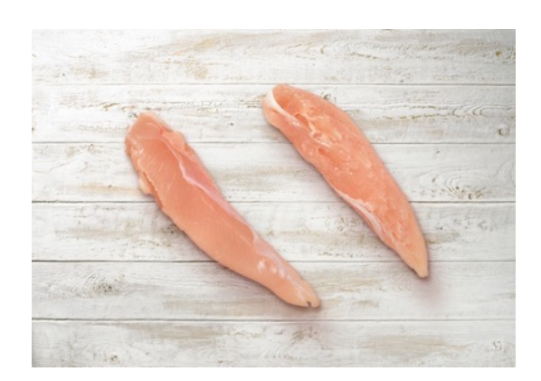
Chicken inner fillet Chicken inner fillet, tap on. Product code: FI 2175