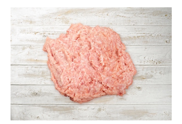
Chicken leg meat, bone separated with grinder, 10 kg crt Fat 3,5%, frozen block.