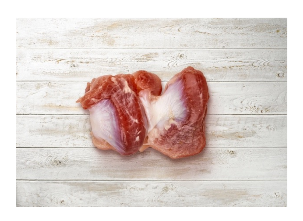
Chicken gizzard, 10 kg crt Product code: FI 2163