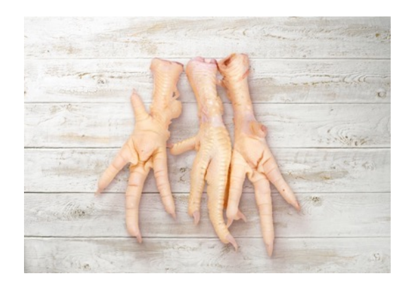
Chicken feet, A-grade, 10 kg crt Chicken feet, processed. Product code: FI 2167, EE 19238