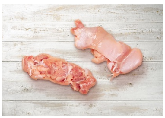
Chicken leg meat, 10 kg crt Chicken drumstick meat, boneless, skinless. Product code: FI 2593