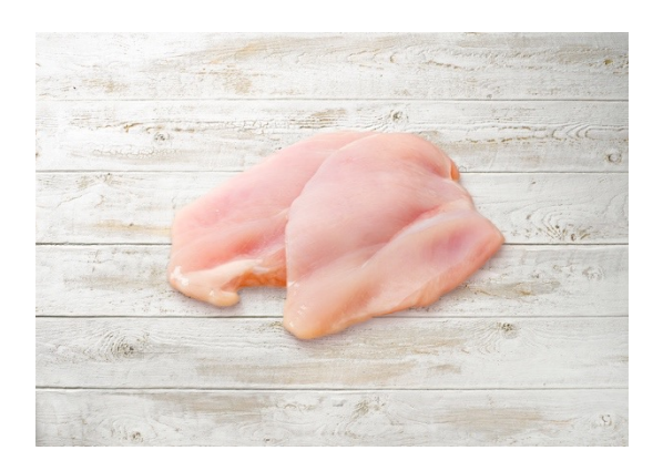
Chicken fillet, horizontal cut Chicken filet 140-160g, lightly salted Product code: 2545