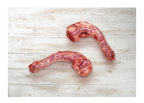
Turkey neck, male/female, approx. 15 kg crt Turkey necks, without skin. Product code: FI 2748 male FI 2757 female