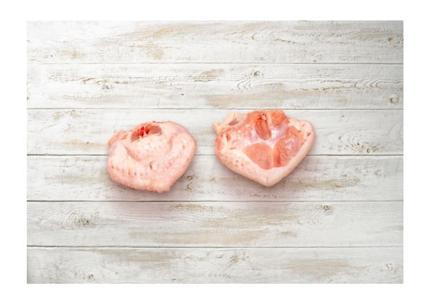
Turkey tail, approx. 10 kg crt Product code: FI 2732