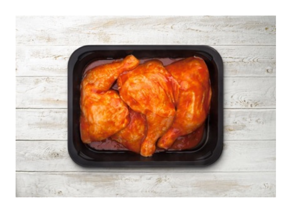
Chicken legs marinated Chicken leg quarters without tail, marinated. Meat content 80%, salt 1,0%. Red marinade includes e.g. paprika, curry, white pepper and garlic. Product code: FI 2416