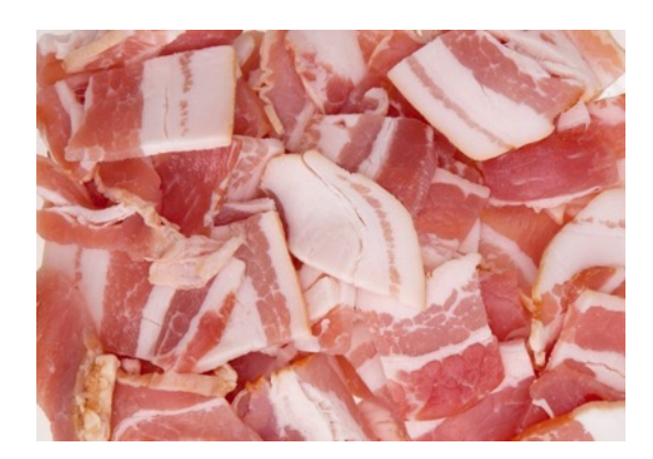
Bacon Flakes 20 x 3 x 20mm-40mm Several package alternatives available; fresh and frozen.

Bacon cubes 10 x 10 x 25mm Several package alternatives available; fresh and frozen.